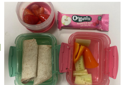
2 years lunchbox