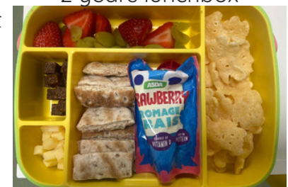
3/4 years lunchbox

During morning and late afternoon sessions, children will be offered a healthy snack. we offer a variety of choices each day ensuring children experience all different tastes and textures. We ask parents in our weekly newsletter to contribute towards this snack with a notice of request for food products.